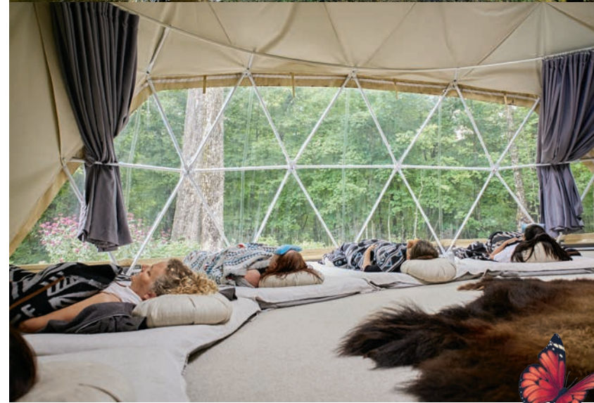
Dimensions, an hour east of Muskoka, offers gourmet food, yoga, Thai massage and three-hour cannabis journeys under the guidance of a local Indigenous Elder