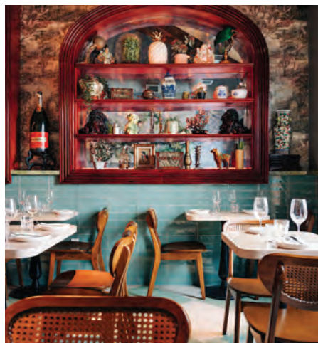
The room is inspired by classic Hong Kong cinematography