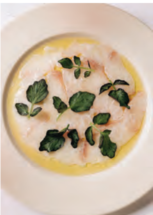
Fluke and fennel carpaccio with watercress