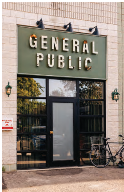
Housed in a former auto body shop, General Public proves it's what's inside that counts

The restaurant's dual personality reveals Agg's understanding that indulgence can be a high-low affair. It can mean happy-hour burgers and pints of house lager or spendy seafood towers chased with Chablis. At most pubs, being offered "bubbles and a bump" could spell trouble, but here it's a cheeky $15 combo: a shot of champagne and two grams of sturgeon caviar. We wouldn't expect anything less from the woman who brought us the bone marrow luge.