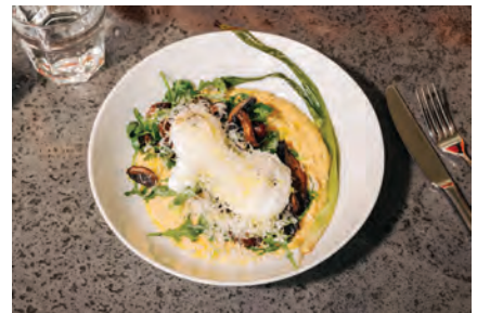
Perfectly poached eggs and roasted mushrooms on cheesy polenta

B ONJOUR BRICHOE has ruled the east end's brunch scene since 1997, but Amber is coming for its croissant-shaped crown. The new restaurant is from ex-Parallel chef George Grabsky, who was born in Ukraine, lived in Israel and came to Toronto in 2018 to work for the Ozery brothers, Toronto's tahini kings.