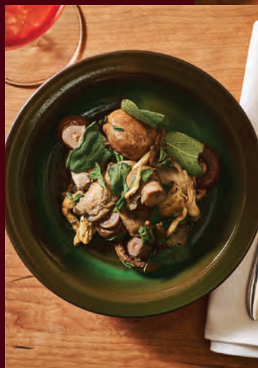
A sautéed mushroom salad