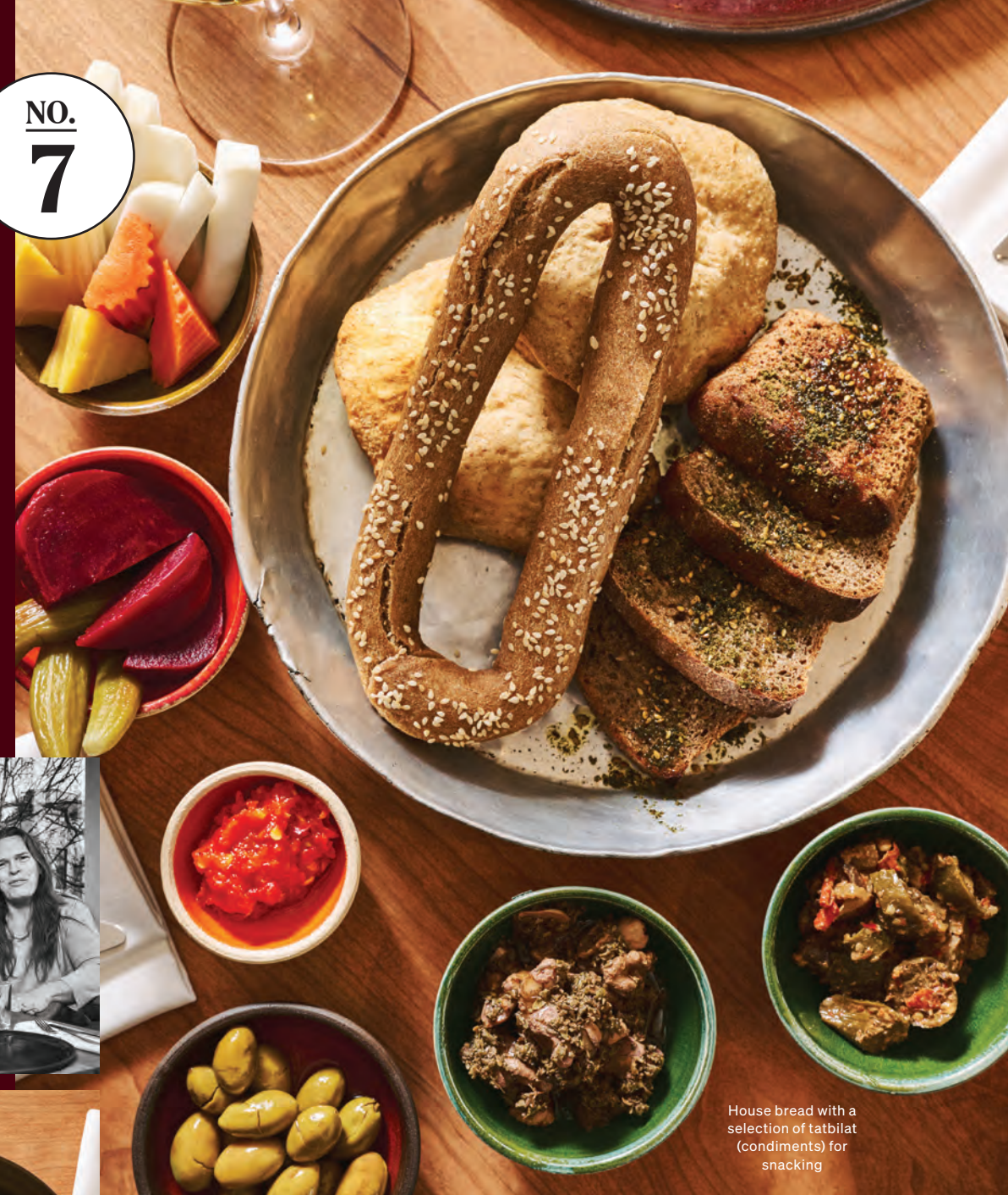
House bread with a selection of tabilat (condiments) for snacking