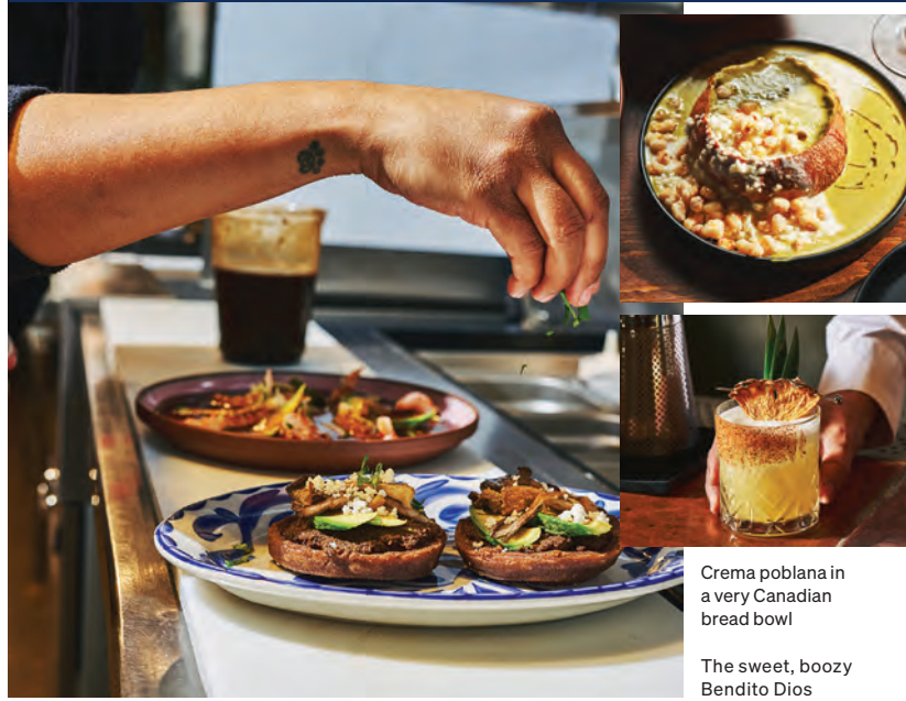
Crema poblana in a very Canadian bread bowl