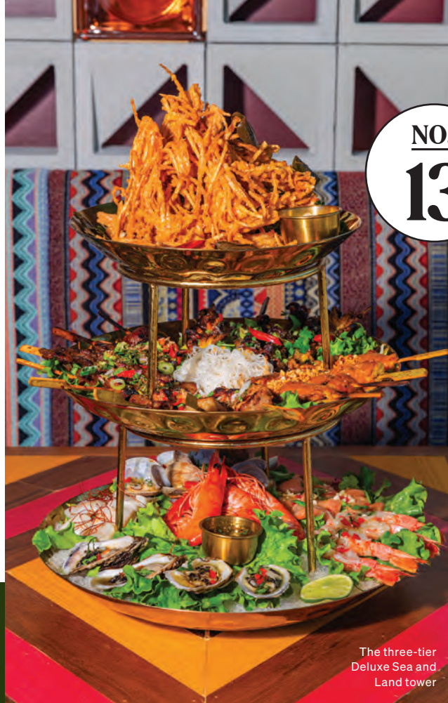
The three-tier Deluxe Sea and Land tower