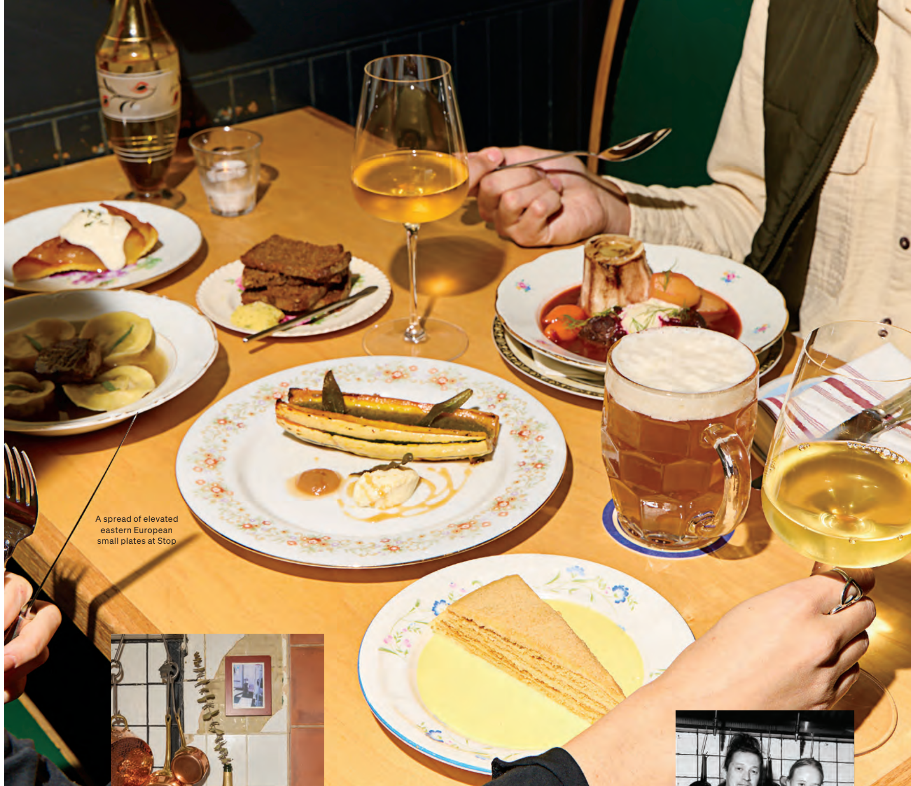
A spread of elevated eastern European small plates at Stop