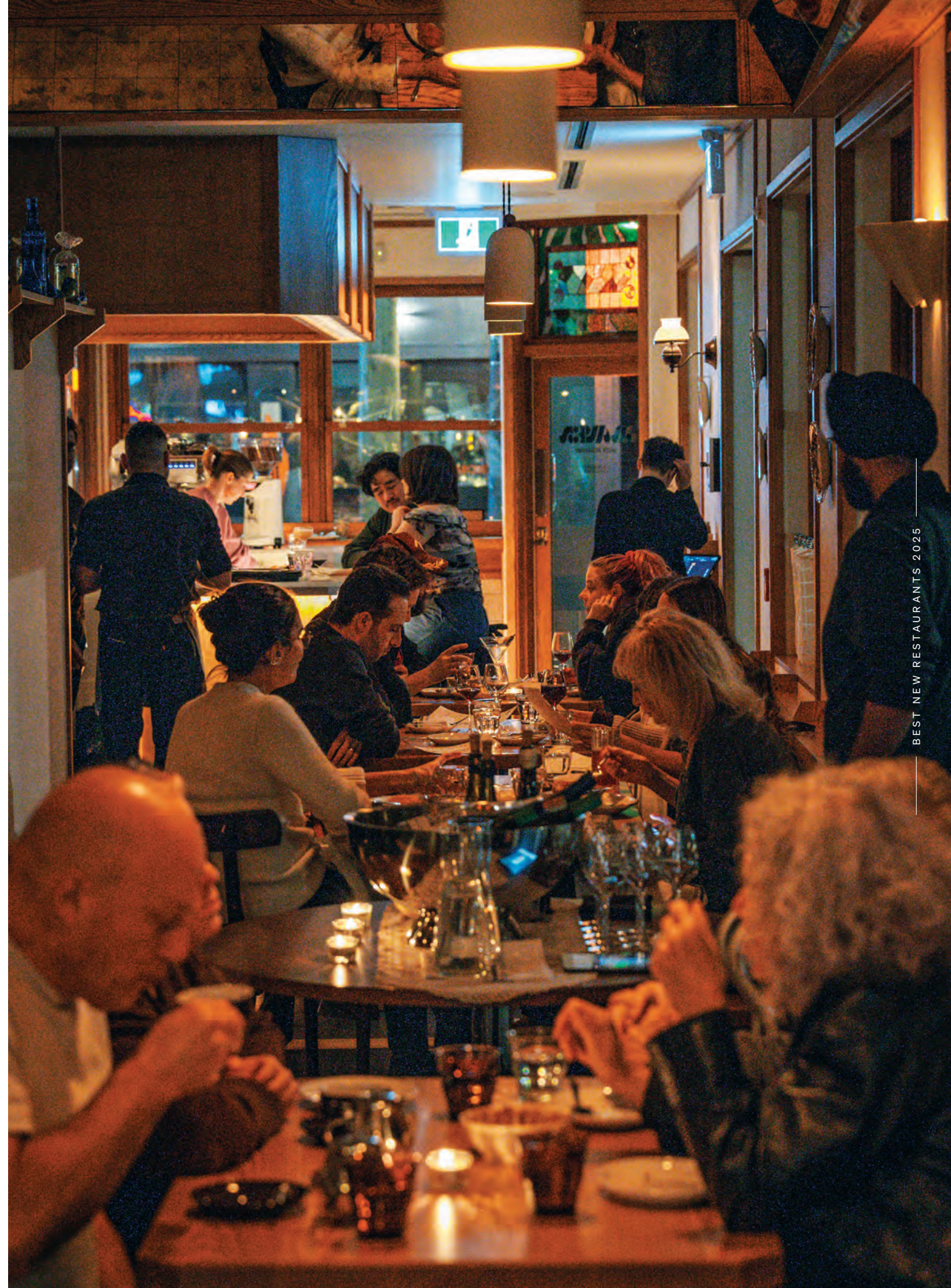
BEST NEW RESTAURANTS 2025