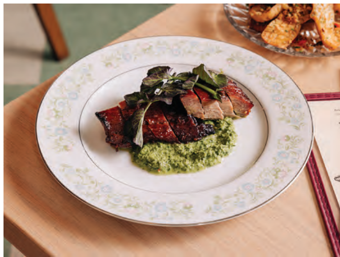
Char siu pork Iberico with a Bajan-style take on chimichurri