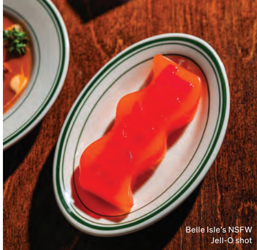
Belle Isle's NSFV Jell-O shot

The drinks menu includes a sassy Jell-O shot in the shape of a swear word and cocktails with bonkers names. To wit: the Divorced Dad Dinner—a boozy, balanced blend of Cinnamon Toast Crunch–infused bourbon, Amaro Averna, cacao, vermouth and Amarena cherry. It's smooth, spicy and (unlike the feelings harboured by dad's ex) sweet.